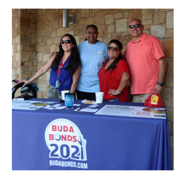
The Garlic Creek Clubhouse and Park